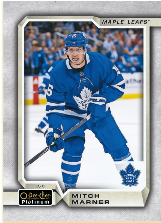
BASE CARD DESIGN