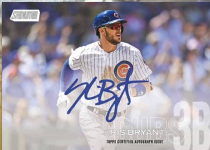
Base Autograph Card