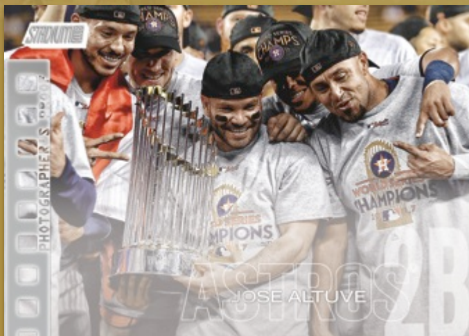
Base Card – Photographer's Proof Parallel