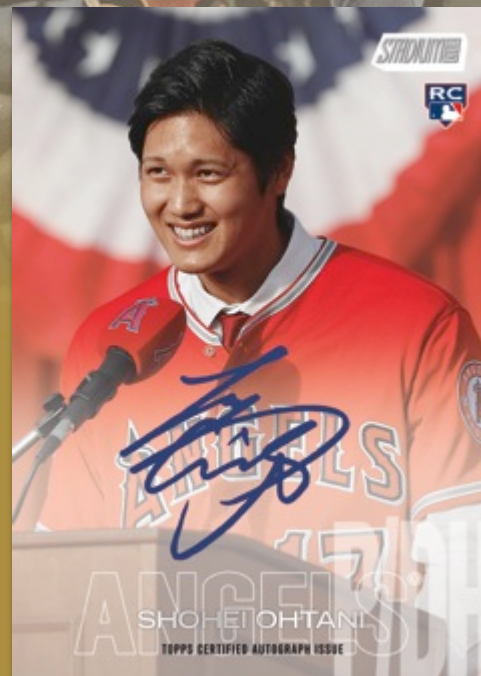
Base Autograph Card