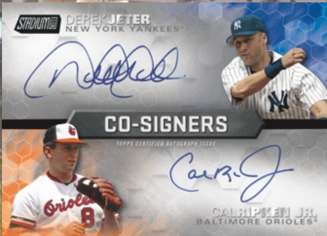
Co-Signers Autograph Card