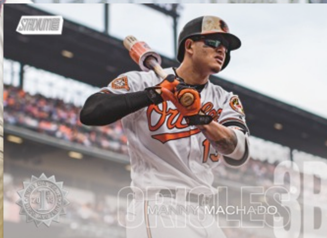
Base Card – First Day Issue Parallel