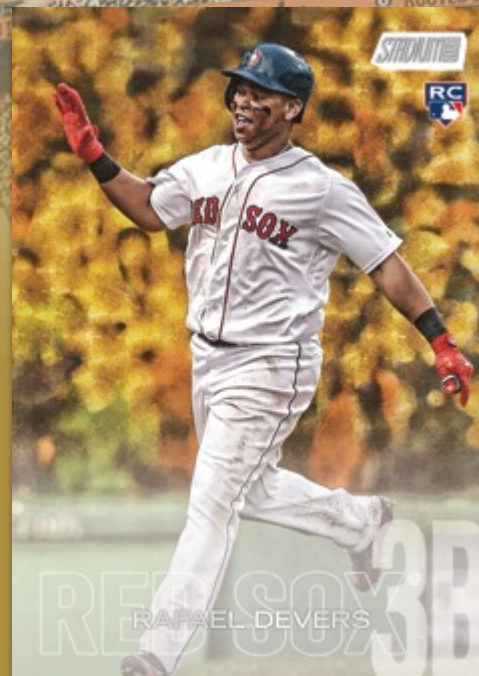
Chrome SuperFractor Parallel