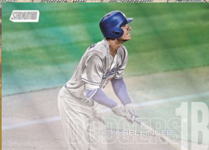
Chrome Refractor Parallel