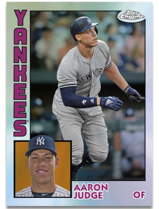
1984 Topps Baseball Insert Card

Also look for limited Base Card Image Variations of notable subjects from the Base set!