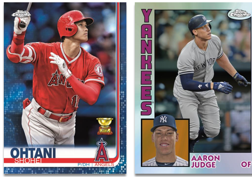
Base Card – Blue Refractor Parallel