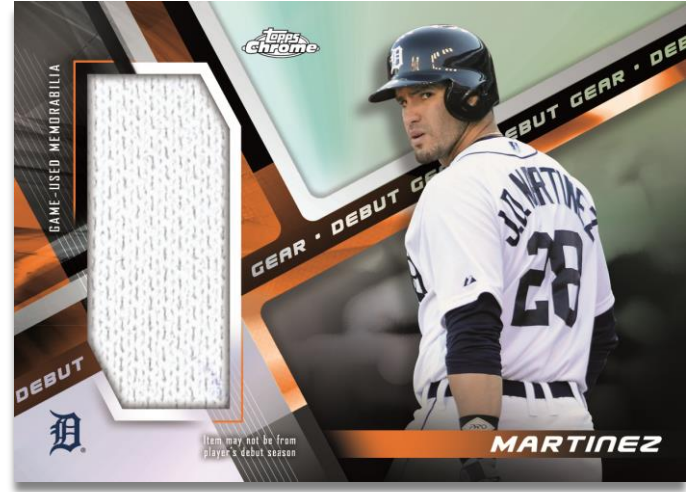
Debut Gear Card