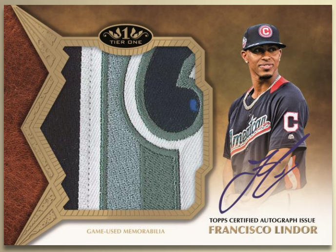
Tier One All-Star Patch Card – Autograph Parallel