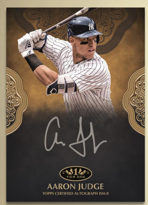
Prime Performers Autograph Card – Silver Ink Parallel