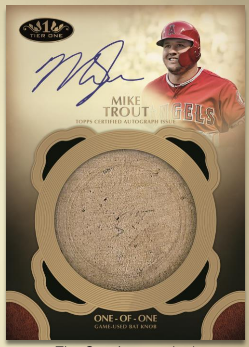
Tier One Autographed Bat Knob Card

Guaranteeing 2 autographs and 1 relic per box, 2019 Topps Tier One Baseball continues to deliver high-end trading cards to collectors.