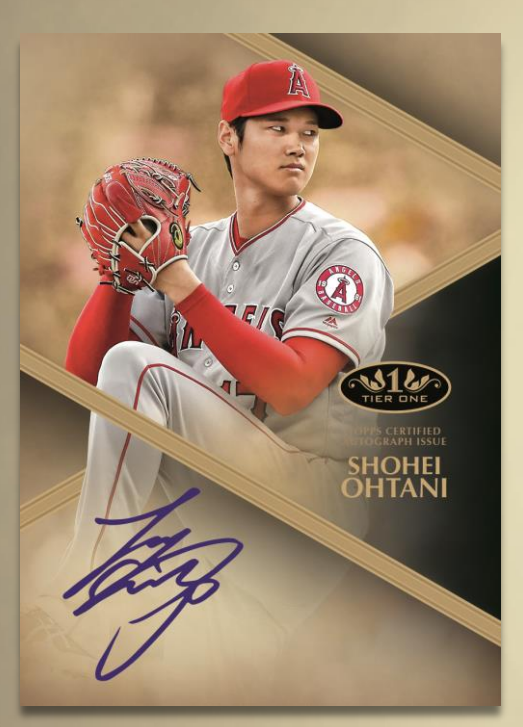
Tier One Autograph Card