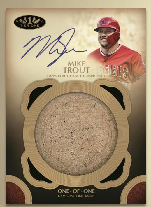
Tier One Autographed Bat Knob Card