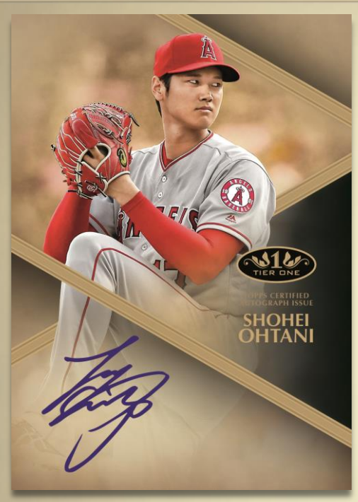
Tier One Autograph Card