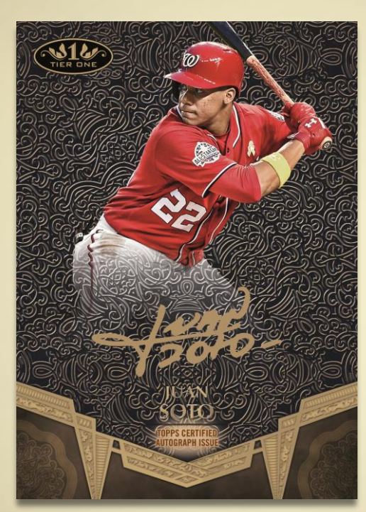
Break Out Autograph Card – Bronze Ink Parallel