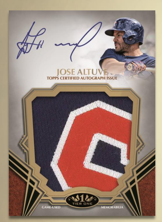
Autographed Prodigious Patches