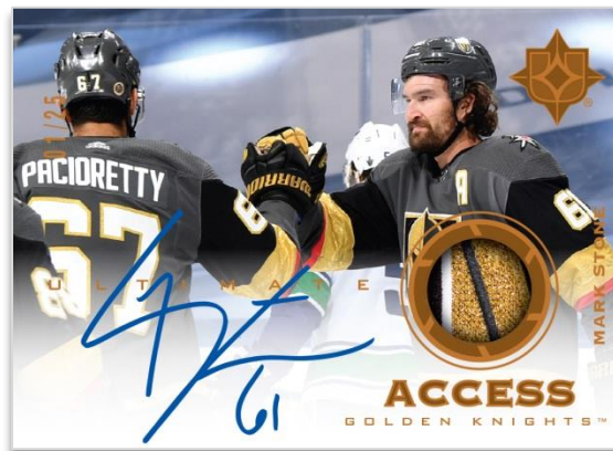
ULTIMATE ACCESS Bronze Patch Auto Parallel

Look for low-numbered Bronze Patch and Gold Tag parallels, including autographed versions .