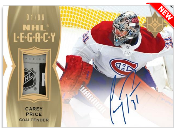
NHL® LEGACY Gold Tag Auto Parallel

The all-new and uniquely-themed NHL Legacy memorabilia insert set features players that come from families with at least one other NHL player in the family tree.