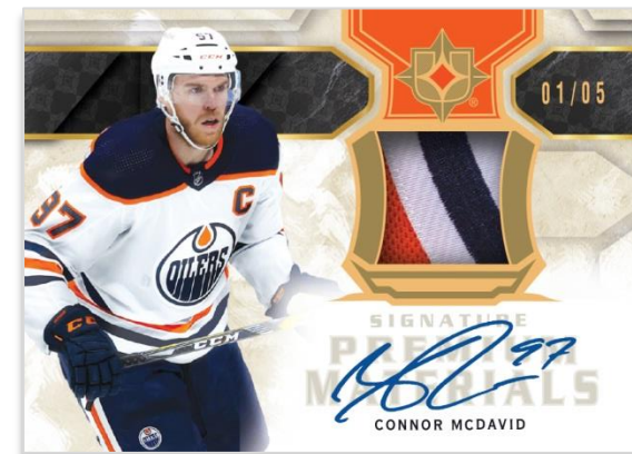
ULTIMATE SIGNATURES PREMIUM MATERIALS

Ultimate Access returns with more dazzling imagery, autographs and premium memorabilia, highlighted by the low-numbered Bronze Patch Auto and Gold Tag Auto parallels.