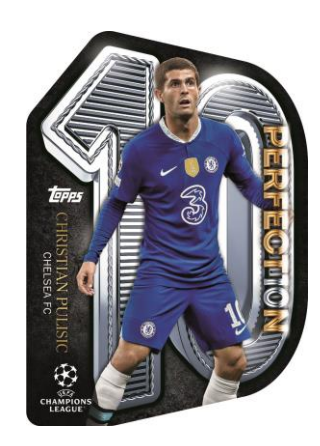
PERECT10N - Christian Pulisic