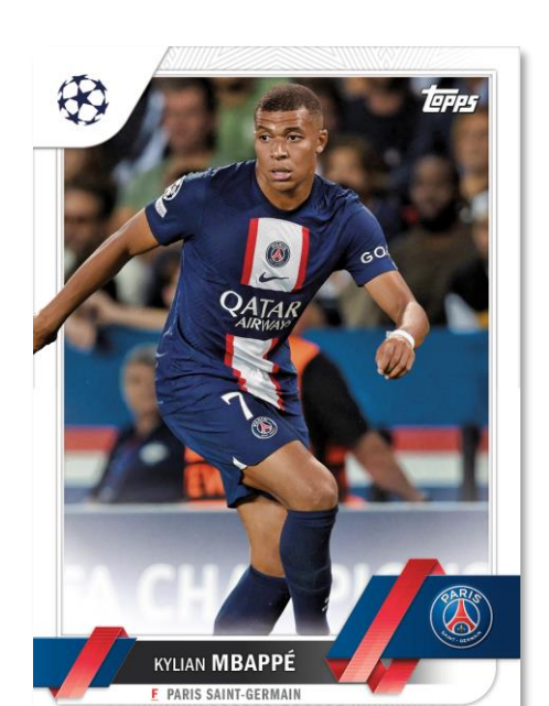
Base Card – Kylian Mbappé