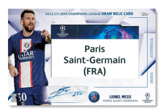
Official Draw Card Autograph Relic – Lionel Messi