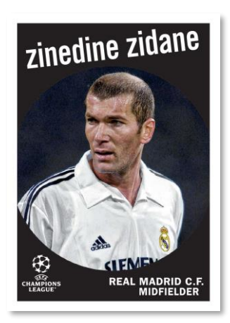
1959 Topps – Zinedine Zidane