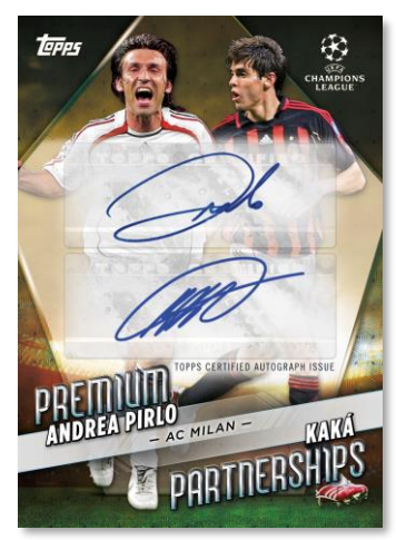
Premium Partnerships Autograph Parallel