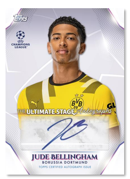
Ultimate Stage Autographs - Jude Bellingham