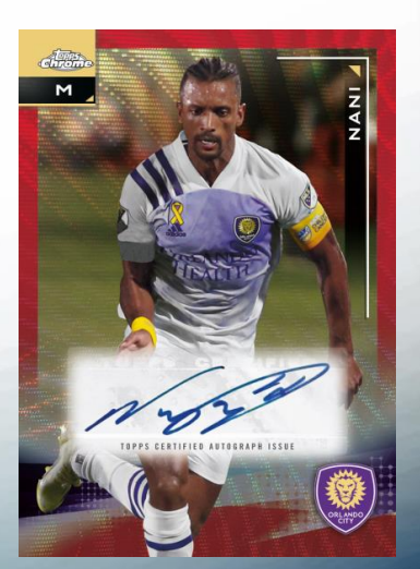
Base Autograph Card – Red Wave Refractor Parallel