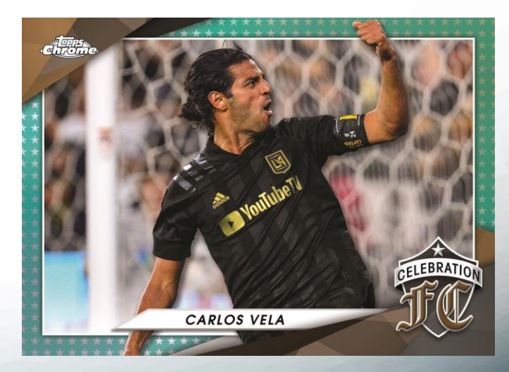
Celebration FC Insert – Aqua Refractor Parallel