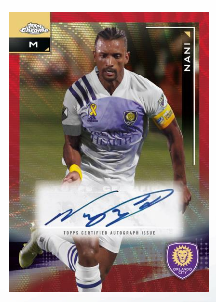
Base Autograph Card – Red Wave Refractor Parallel