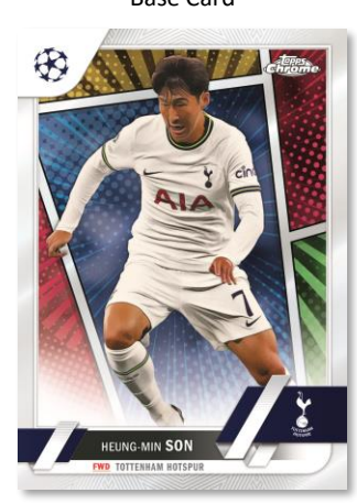
Base Card Hero Variation