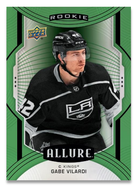
SP'S 101-150 Green Quartz Parallel

The final 50 cards of the Base Set are all SP Rookie cards! Grab 1 regular SP Rookie card per pack, on average. Also keep an eye out for a deep bench of low-numbered parallel cards, from the Green Quartz parallel <u>#'d to 99</u> to the rare <u>1-of-1</u> Golden Treasures non-auto & auto parallels!