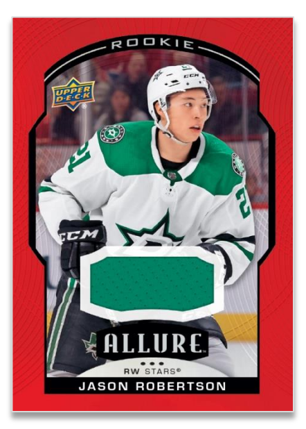
BASE SET Regular